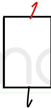
Busbar on both SHORT side