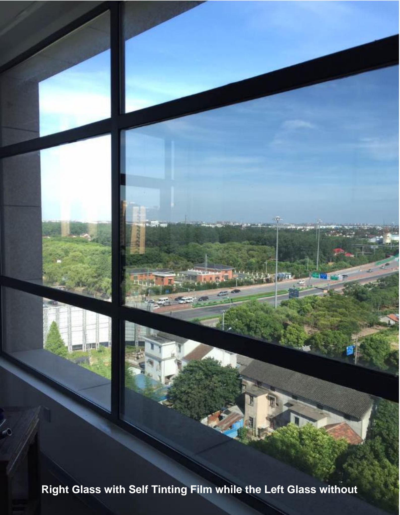
Right Glass with Self Tinting Film while the Left Glass without